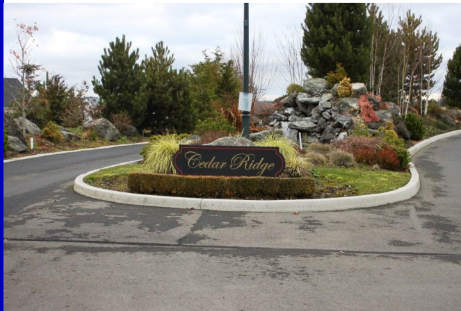
Entrance to community

Views of Sequim Bay & San Juan De Fuca, Mt. Baker & Magnificent Olympics! NWMLS #369240 OLS #262409 2.5% SOC