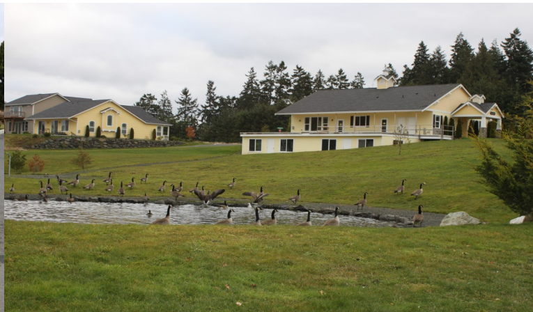
View of community clubhouse and pond